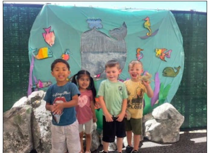
Having fun with our Under The Sea theme for summer.

We're WILD about learning and WILD about God!