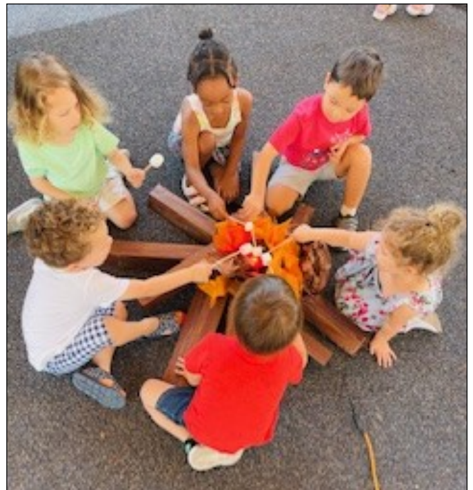
Camping fun with "roasting" marshmallows.